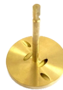
Spindle No. 1