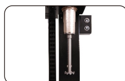
Extra long shaft(modle L/A series)