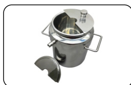
Max. capacity: 20L, model 5A