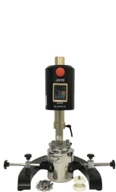
BEVS 2501/S(lite version)

BEVS 2501 series Laboratory Mixer adopts frequency-adaptor to adjust speed with the advanced touch-screen control design. It can disperse, mix and grind various liquids. User can set speed and running time. It's a good choice for R&D and QC purposes.