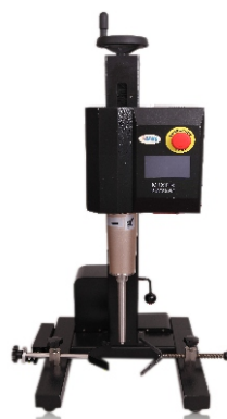
BEVS 2501/1L, 2L