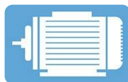
Frequency modulation motor