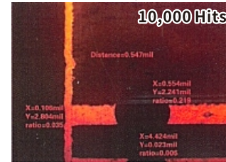
10,000 Hits Cross-Section HW Roughness: 0.55mil 10,000孔后切片 孔粗:0.55mil